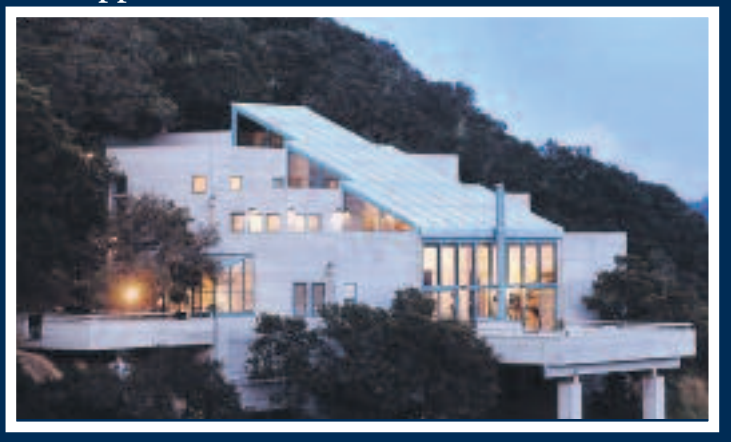
SOLD! Represented Seller 4087 Happy Valley, Lafayette - Listed at $2,998,000