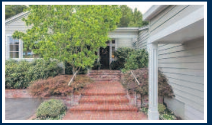
SOLD! Represented Buyer 319 Tappan Terrace, Orinda - Listed at $2,475,000